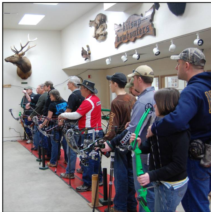
Below: Shooters on line at KBH Archers