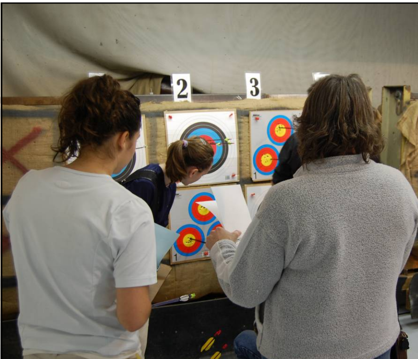
Below: Ladies' Group Tallies the Scores

Members ... Sell your used archery, hunting, camping equipment or other sporting goods Your "classified ad" could be HERE FREE