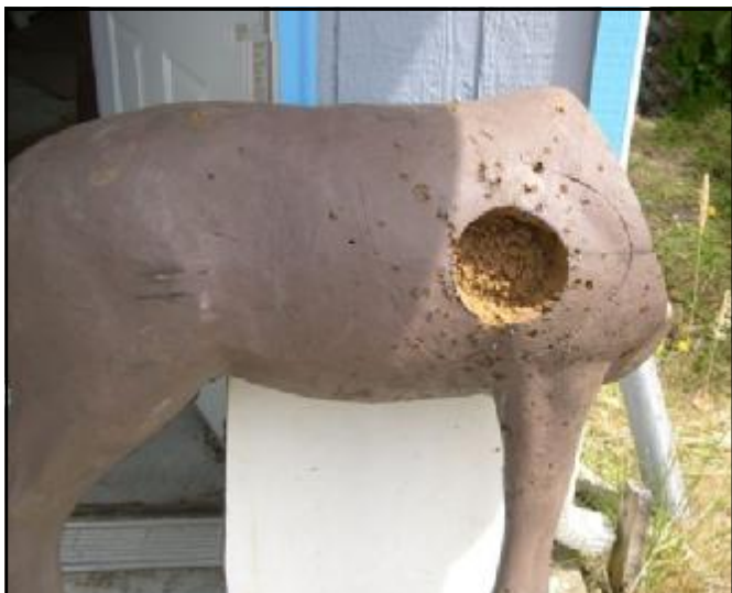
Above Left - Fig 2 - Large damage area cut out