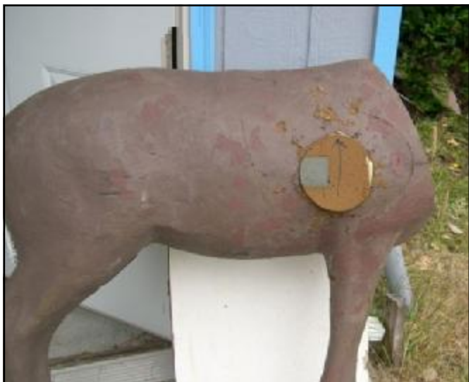
Below: Fig 4 - Large damage plugged

WSAA Chartered Clubs and Shops Publicize YOUR Facilities and Events Send your News and Reports to: Quiver@WashingtonArchery.org