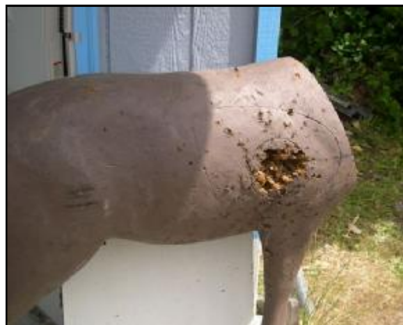
Above - Fig 1 - Target needs repair

Now that the integrity of the target has been restored, we'll continue later with bringing back the natural appearance of the critter.