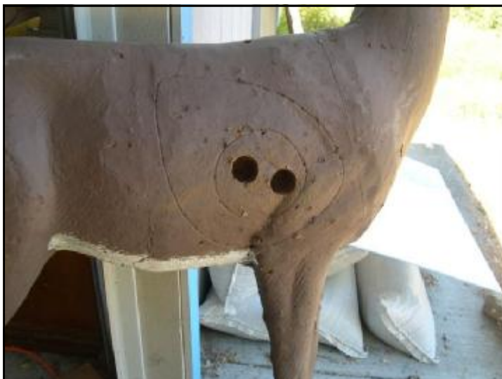
Above Right - Fig 3 - Small damaged areas cut with hole saw