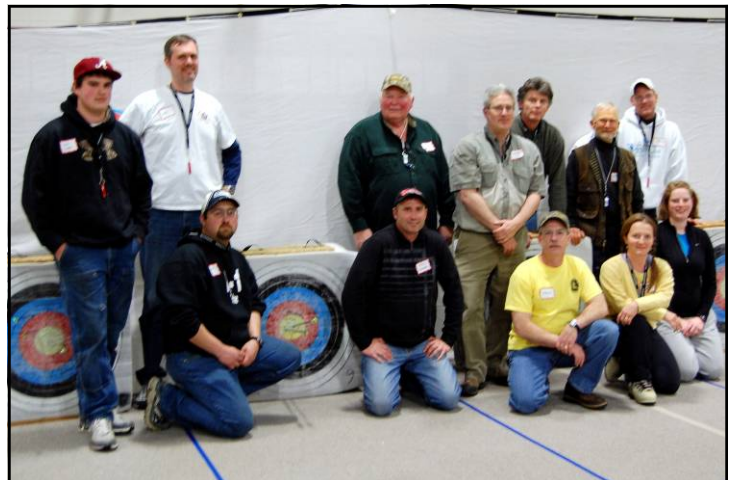
Above: Graduates of February BAI at Sequim