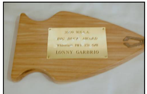
Above: Big Buck Award Plaque

Applications for this award must be sent to the person indicated on the form.